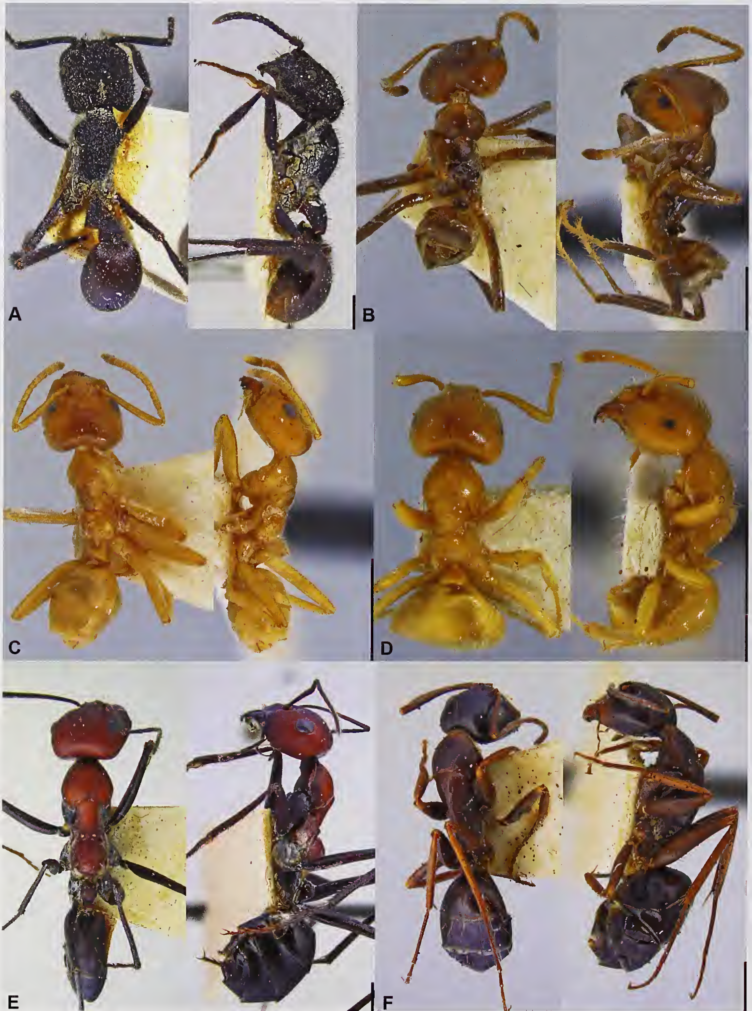
Fig. 3. (A) Paralectotype ♀ dorsal/lateral of Pogonomyrmex mayri Forel, 1899. (B) ♀ dorsal/lateral of Azteca velox Forel, 1899. (C) Syntypes ♀ of A. delpini antillana Forel, 1899. (D) Lasius myops Forel, 1894. (E) Cataglyphis savignyi (Dufour, 1862). (F) Camponotus alii Forel, 1890. Scale bars 1 mm.